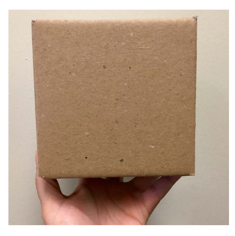
Step #1: Get a Box

Note: Picture shows a 5x5x5 in. box, but it can be bigger.