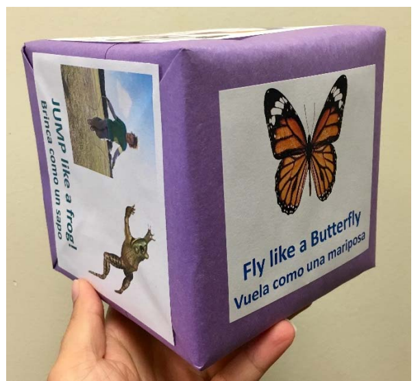
Step #3: Glue animal dice pictures on each side